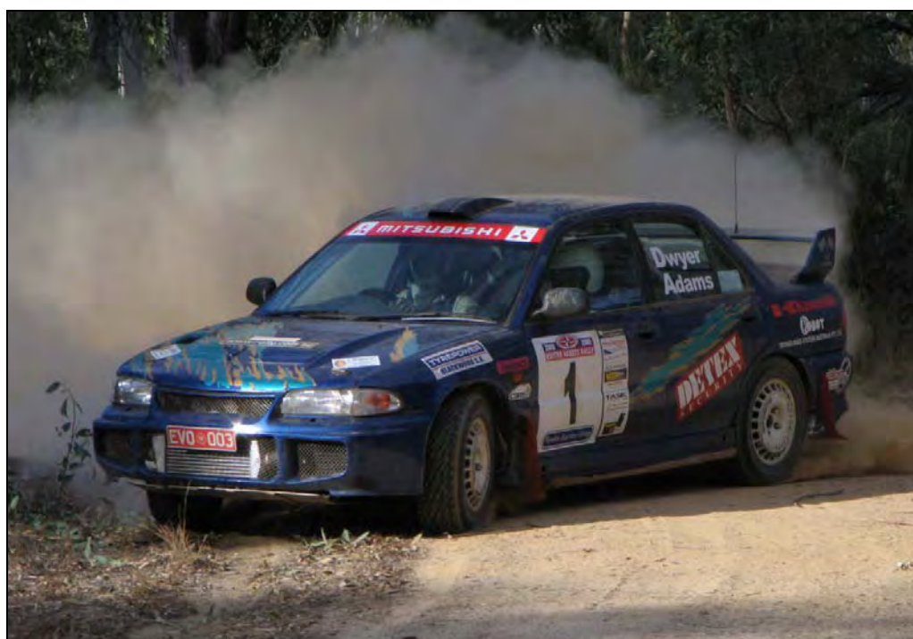
2005 1 st Outright – Declan Dwyer / Amanda Dwyer

Round 3 of the 2006 SA Rally Championship