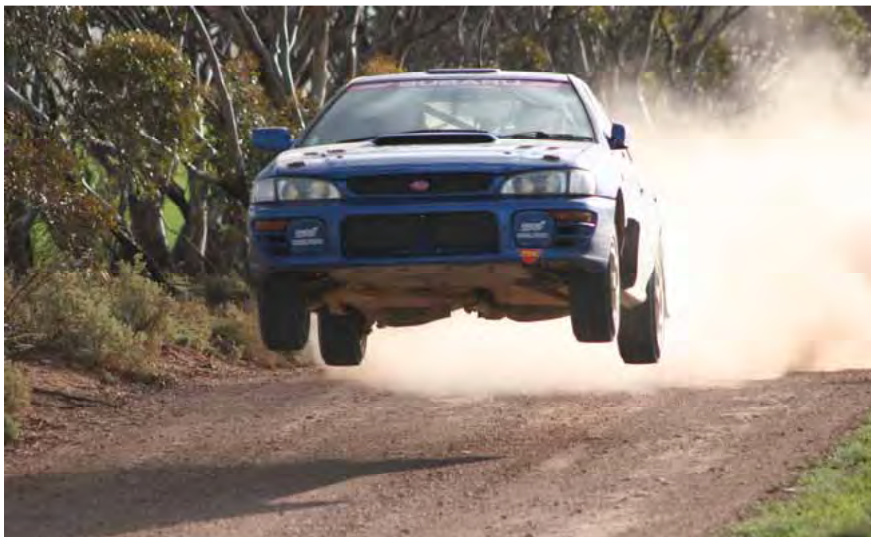
Car 6 - Matthew Selley/Joana Fuller - 2nd Outright