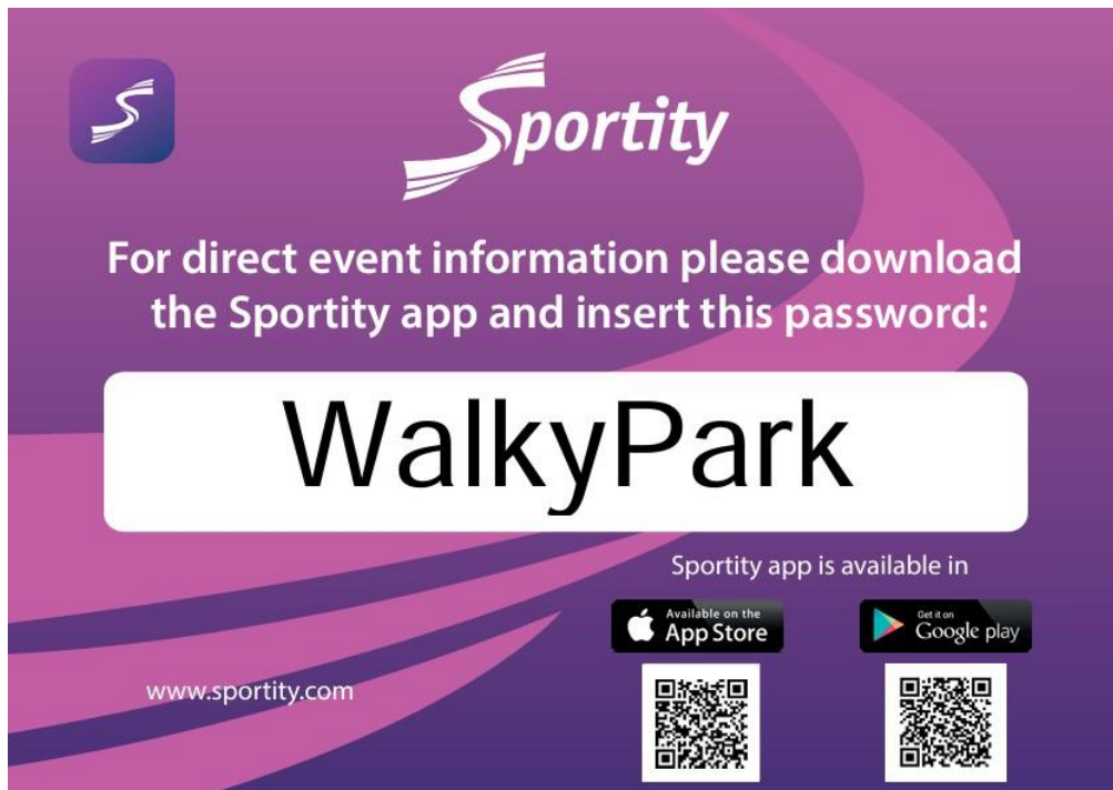
Image 7- Sportity Login