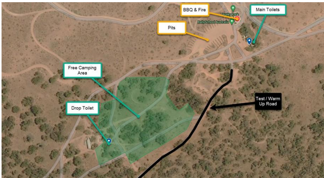
Image 2 - Camping Options