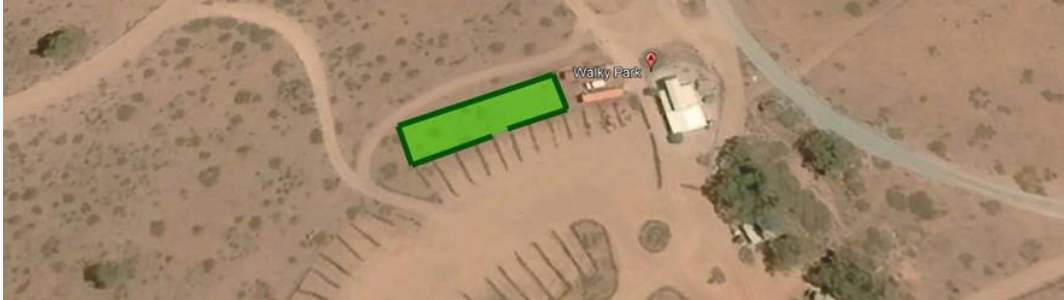
Image 3 - Viewing Area