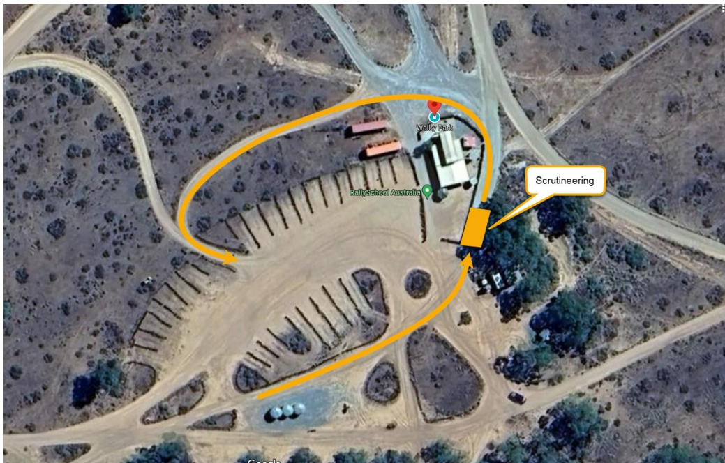
Image 1 - Scrutineering Location