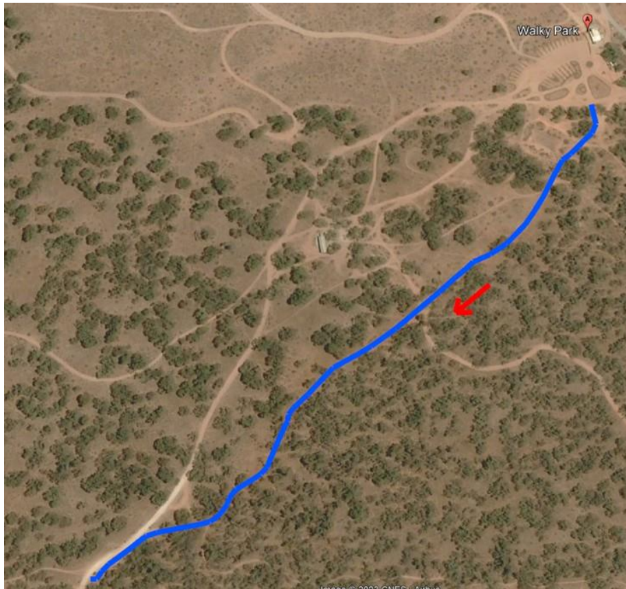
Image 6 - Warm Up / Test Track