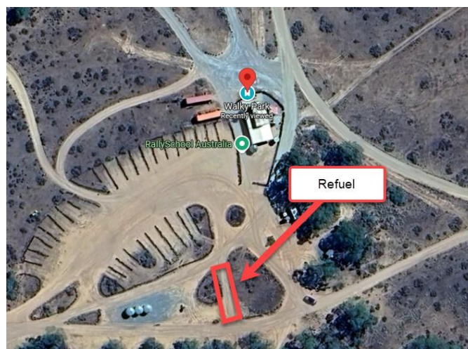
Image 5 - Refuel Location