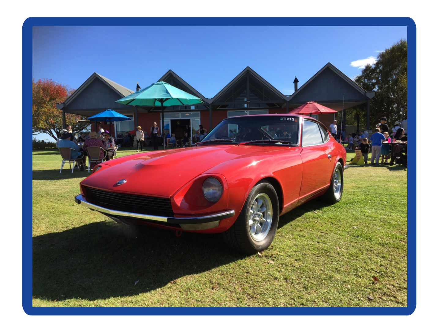
Photo of my Datsun 240Z, 1972. Engine has a high lift cam, high compression head, triple Dellorto dlha40 carbs and extractor exhaust. Suspension has been lowered 50mm. Alloy wheels are from Performance Wheels originally made here in Adelaide.