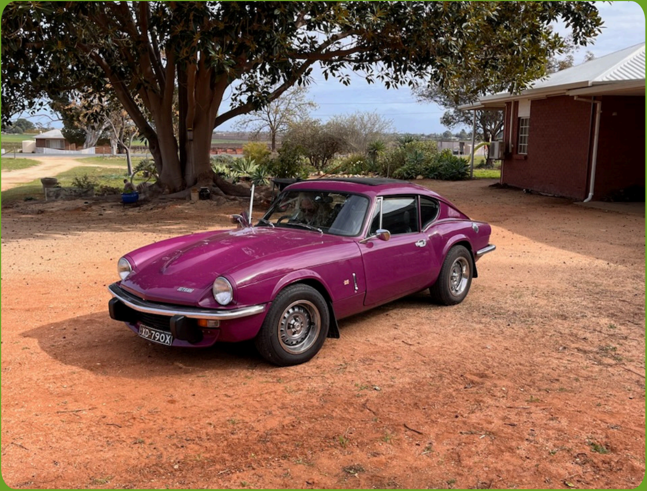
Evans 1973 Triumph GT6 - 6 Cylinder 2 litre overdrive