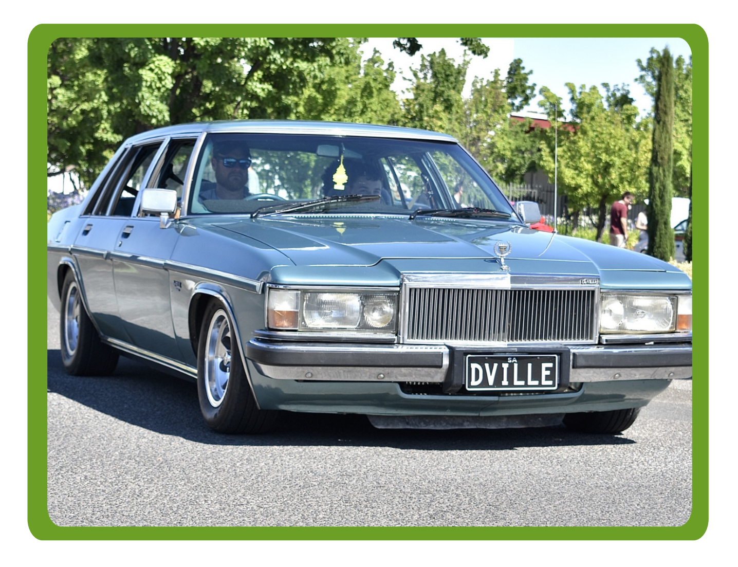
Here's Casey and my 1984 WB DeVille Series 2

308 and trimatic. It has every caprice option except leather, which at the time, would have saved a buyer something like $6k over ordering an actual Caprice.