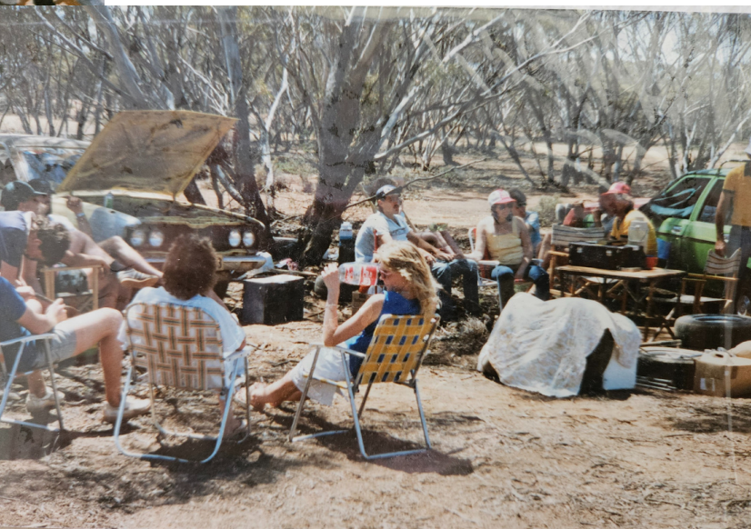
Attending Walky Sprint November 87