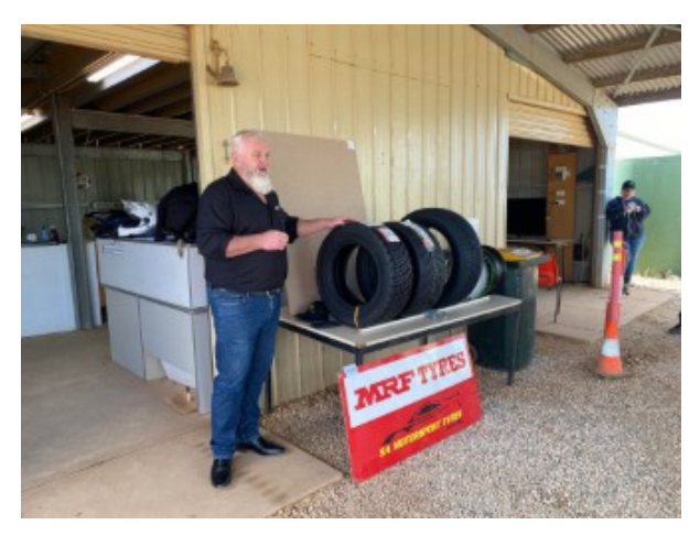
WACC Newsletter - September 2024