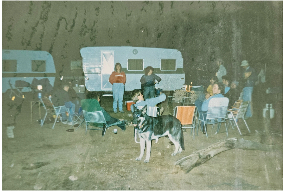
Camping and tree planting May 1988