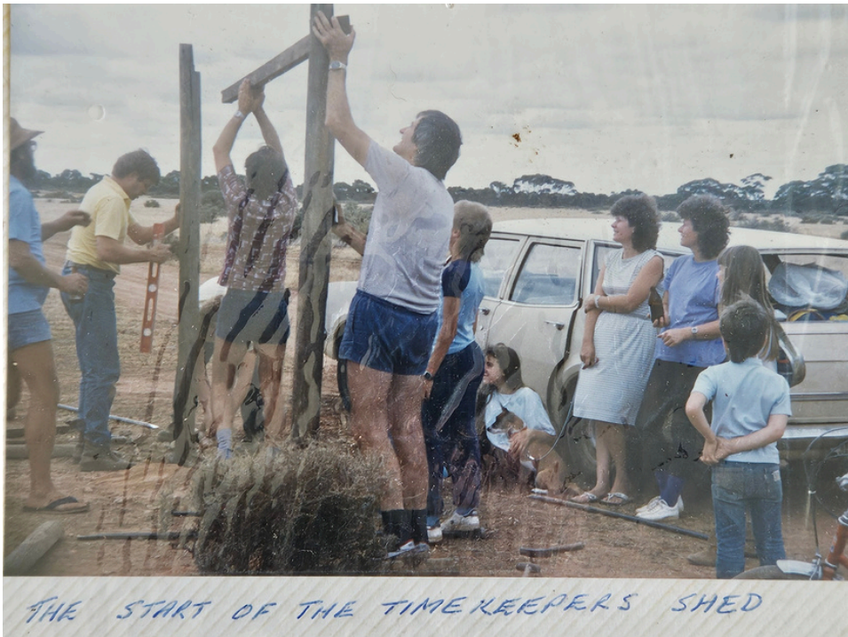
Start of the timekeepers shed April 1989