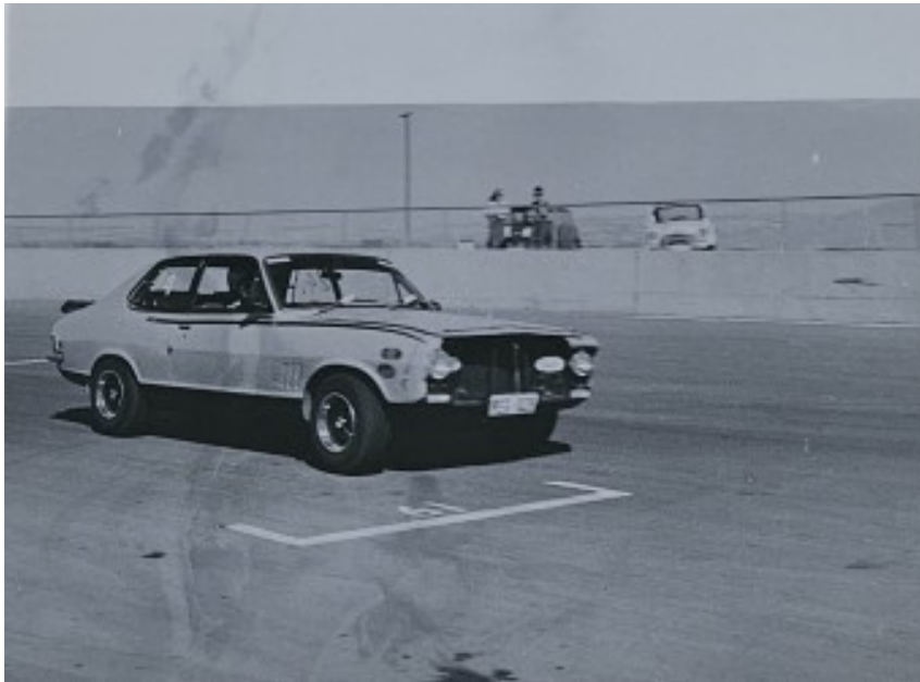
AIR - Nov 72