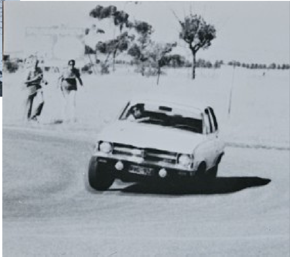
Dec - 71