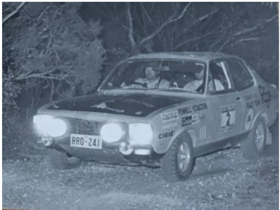
SAS 10 - Dec 72