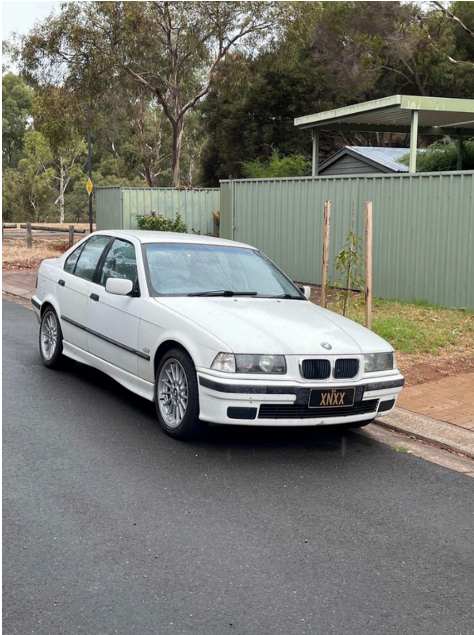
Allesandro Dametto's 1997 BMW